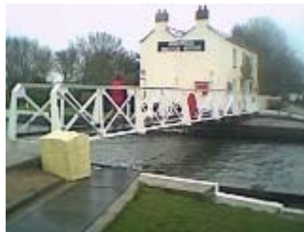
Junction Bridge house